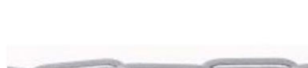
Chain long-link A4 8301