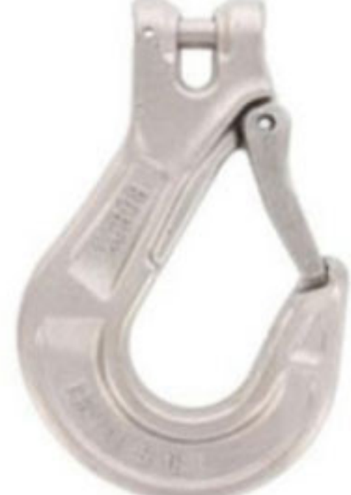
Clevis sling hook duplex D6 815112446