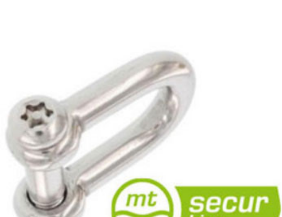
D-shackle secureLine 8151414