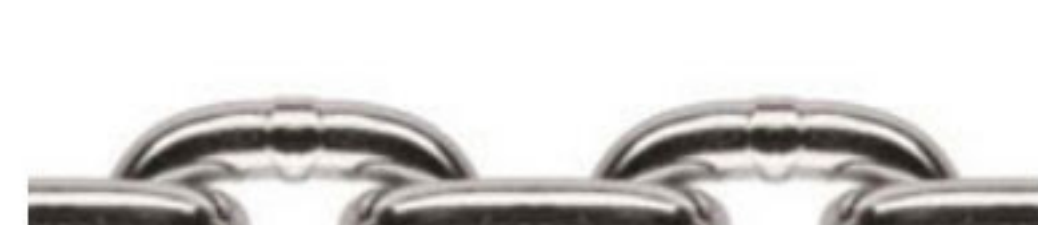
Chain short-link A4L 83154