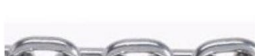
Chain short-link A4 874741