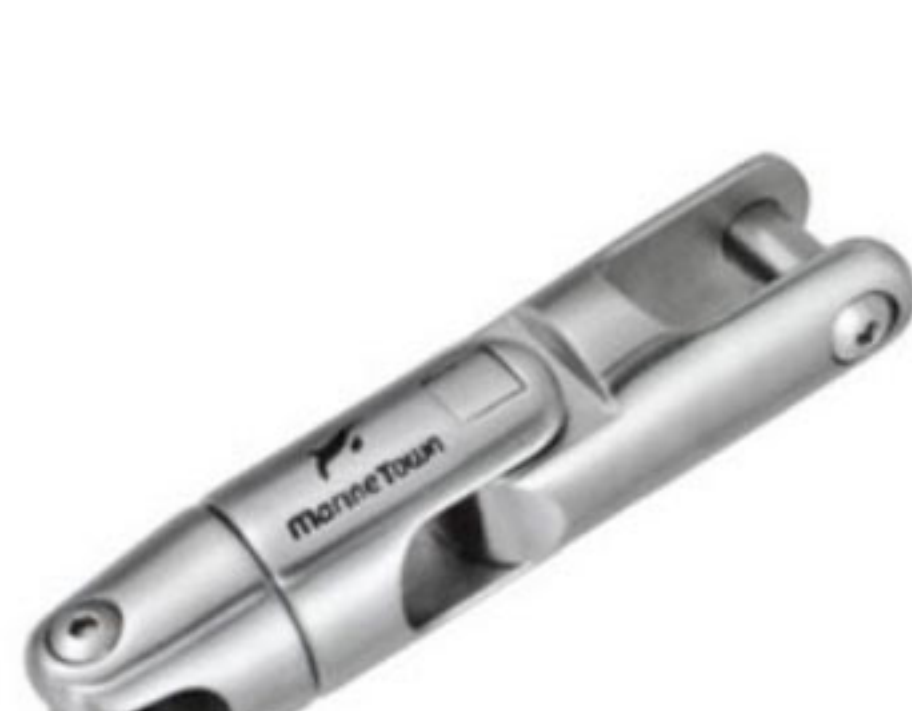
Anchor chain swivel with joint 86084