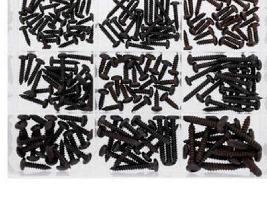
Assortment boxes 815217