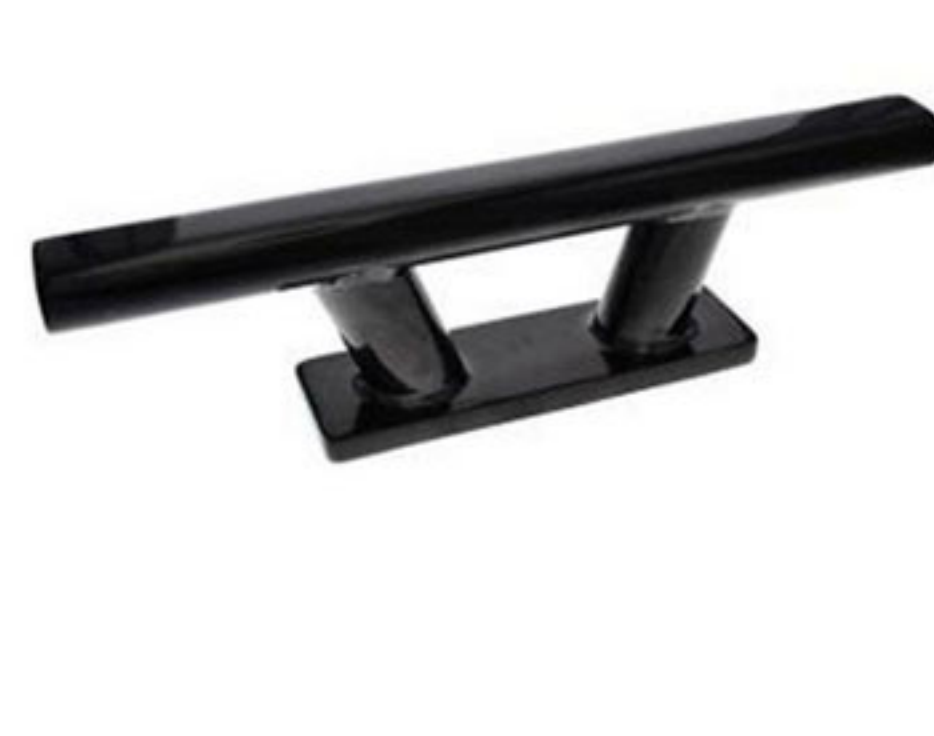
Cleat with internal thread 8680