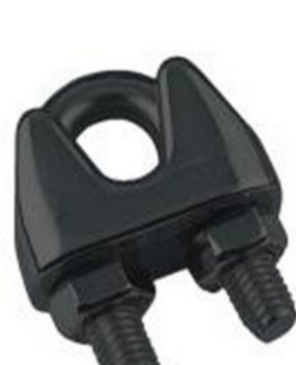
Wire rope clip 8248