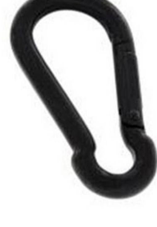
Spring hook 8249