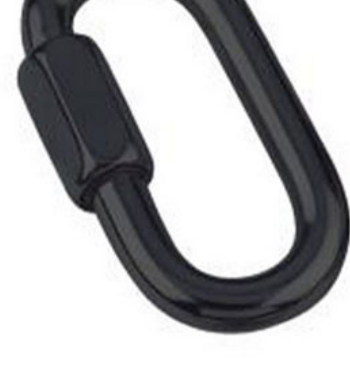
Quick link 8253