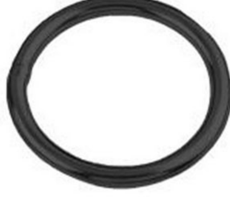
Ring, round 8229